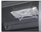
Patented anti-Scale system