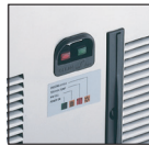
Front ON-OFF Switch